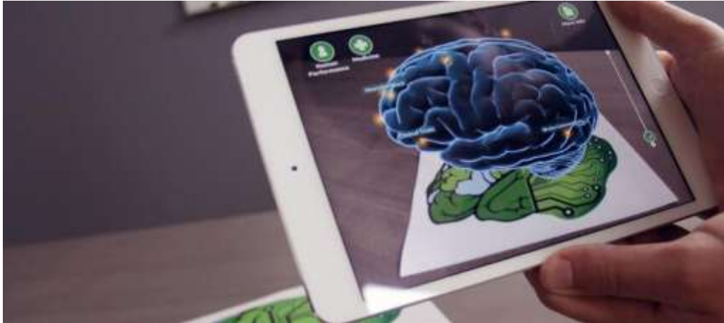
Fig1. Educating Masses With Augmented Reality

Conventional Educational Means Might Tend To Hinder The Concepts And Ideas Leaving Them Obscured From The Original Idea Behind The Subject. Traditional Theoretical Learning Makes It Difficult For Curious Minds To Quench Their Thirst Of Knowledge. Augmented Reality (AR) Can Pave Down A Way To More Intuitive And Effective Learning Making It Feasible For Students And People Of All Ages To Learn Things In A Quite Easy And Simple Manner Saving Time And Giving Up Faster Results [2].