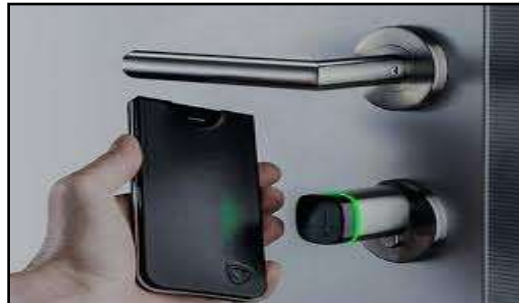
Fig3: Wireless door locks

With the use of wireless door lock any person can remotely lock and unlock the door or share the access with others using mobile apps. Wireless door lock is remotely lock and access to your door from smart phone. Smart door lock system offers many features to any home or business. Due to wireless lock all the doors of the school and education centers well integrated. This provides security to the schools.