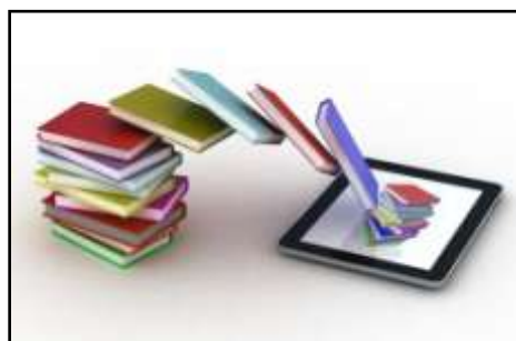
Fig2: Books providing a better way to Learn

Ebook is always in electronic format which allows the students to carry library of hundreds of books with them with greater ease. We can easily download and use it efficiently[5]. Now most of the mobile devices can hold hundreds and thousands of data easily so we don't require physical storage of book. Ebook gives opportunity to the students to expand the learning process.