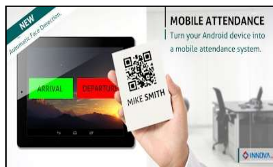
Fig4: Attendance tracking systems

Attendance tracking system enables tracking attendance of the student with accuracy using RFID. This system allows security to the educational institutions and can help in many ways. It helps the teacher to input the data related to the student directly in to the computer. This increases the efficiency of the work. It can help to track the number of times a student has reported to the class.