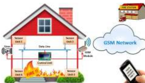
Fig: Overview of the system

The proposed fire alarm systems are placed inside the arena where multiple sensor units (each comprising smoke / gas and temperature detector) which has fire safety concerns. All the sensors are connected a data input line to the control unit. So whenever, any of the sensors detects any fault condition, the control units starts its action. The local siren are activated and GSM module. Thereby, the alarm message will be rendered at the same time through the GSM networks to the authority and the fire stations nearby.