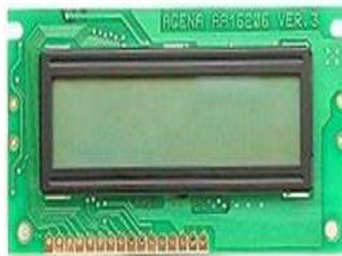
Fig 2 : LCD

Liquid crystal display are interfacing to microcontroller 8051. Most commonly LCD used are 16*2 & 20*2 display. In 16*2 display means 16 represents column & 2 represents rows.