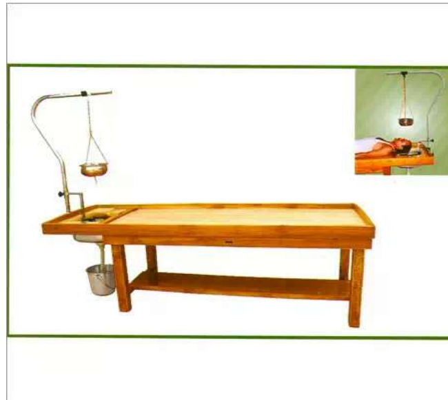
Fig.1. Conventional Shirodhara Technique