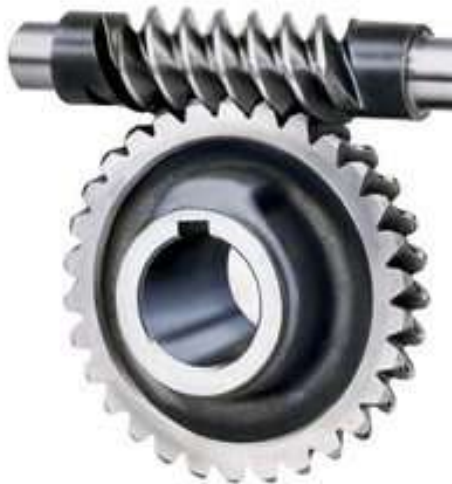
Fig.3. Worm Gear

Friction is an issue with all worm sets; the worm gear cannot transfer motion back to the worm drive in most instances. Lubrication and ground teeth both contribute to the sets' overall silence while minimizing friction. Worm gear sets are usually produced in pairs due to their precision.