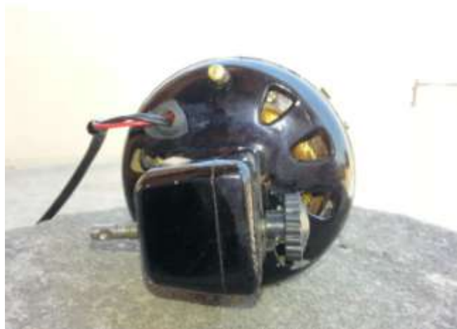
Fig.2. AC Motor