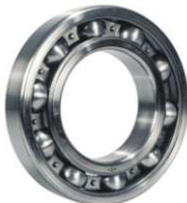
Fig.6. Roller Bearing

rings. The relative motion of the pieces causes the round elements to roll with very little rolling resistance and with little sliding.