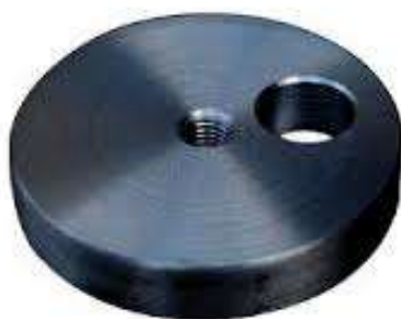
Fig.5. Eccentric mechanism

Eccentric mechanism satisfy both need of project which are converting uniform rotary to oscillating motion and variation in stroke length.