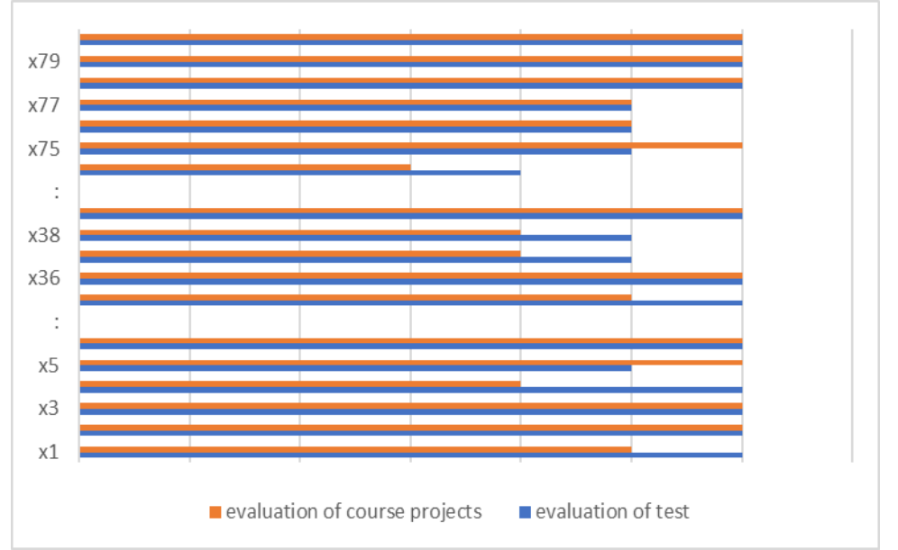
Table 2: Experimental results from the evaluation of course projects of students