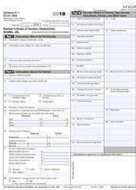
Fig: Schedule K-1 Form

Now when filing our taxes we make use of the above form but we are not aware of the technology used to produce such forms for our convenience. In this paper we study the ways in to automate the process of tax filing for large number of partners. The use of these k-1 documents can be automated using the latest technologies like RPA, automating with Visual Basics since the input to any tax form would be in an excel based template. By automating the traditional K-1 documents we can process multiple partners at a time.