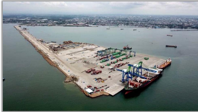
Figure 1. Cargo ship docked at the Dock of Makassar New Port (MNP)