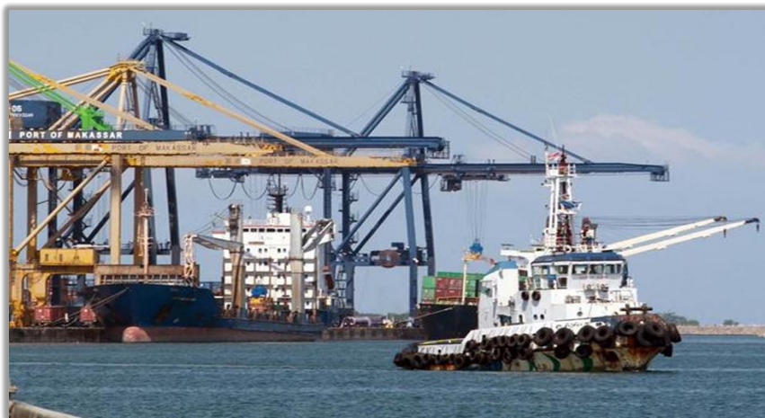
Figure 2. The scouting ship waiting for the ship that will learning on the pier at Makassar Port

Scouting facilities in the form of scouts are 3 units of ships and are served by scouts of 8 (eight) people. Every ship that will enter or leave the port, must submit a request for guide services through Port Corporation of Indonesia IV Makassar Branch and forwarded to Syahbandar/ADPEL