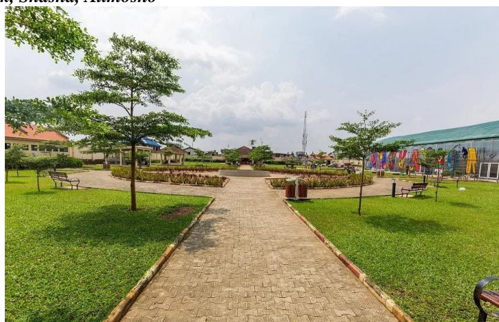
FIGURE 6: LASPARK. [Picture of Rafiu Jafojo Park] [JPG].