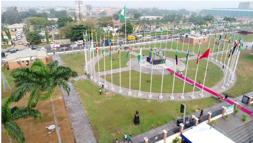
FIGURE 2: LASPARK. [Picture of Johnson Jakande Tinubu (JJT) Park] [JPG]. LASPARK GALLERY. Retrieved on February 9th, 2024 from https://lasparkportal.lagosstate.gov.ng/parks-gardens/