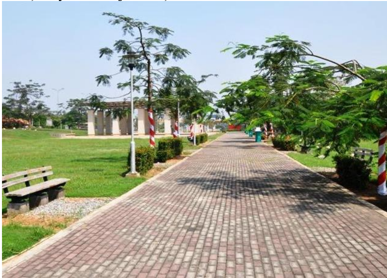
FIGURE 8: LASPARK. [Picture of Muri Okunola Park] [JPG]. LASPARK GALLERY. Retrieved on February 9th, 2024 from https://lasparkportal.lagosstate.gov.ng/parks-gardens/