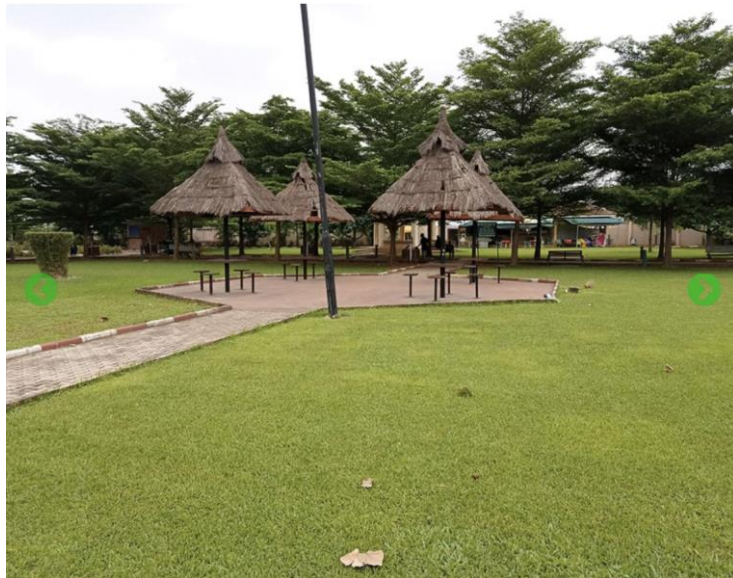
FIGURE 3: LASPARK. [Picture of Ndubuisi Kanu Park] [JPG]. LASPARK GALLERY. Retrieved on February 9th, 2024 from https://lasparkportal.lagosstate.gov.ng/parks-gardens/