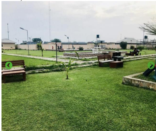
FIGURE 7: LASPARK. [Picture of Ikorodu Recreational center] [JPG]. LASPARK GALLERY. Retrieved on February 9th, 2024 from https://lasparkportal.lagosstate.gov.ng/parks-gardens/