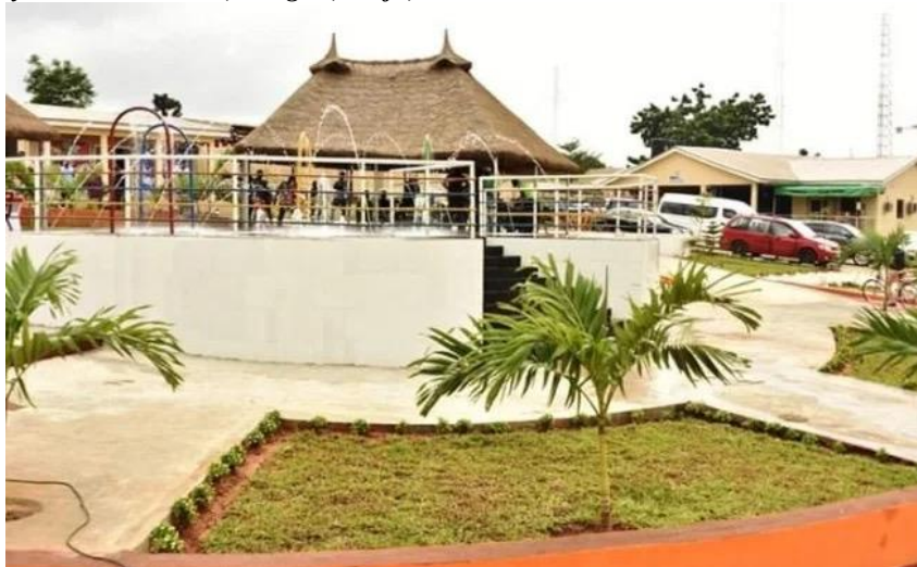
FIGURE9: LASPARK. [Dr. Abayomi Finnih Park] [JPG]. LASPARK GALLERY. Retrieved on February 9th, 2024 from https://lasparkportal.lagosstate.gov.ng/parks-gardens/