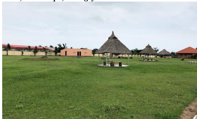
FIGURE 4: LASPARK. [Picture of Badagry Recreational Park] [JPG]. LASPARK GALLERY. Retrieved on February 9th, 2024 from https://lasparkportal.lagosstate.gov.ng/parks-gardens/