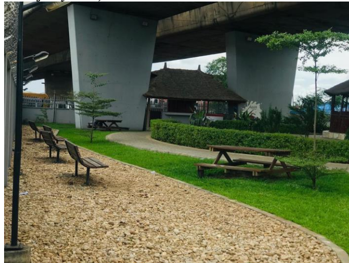
FIGURE 5: LASPARK. [Picture of Infinity park] [JPG].