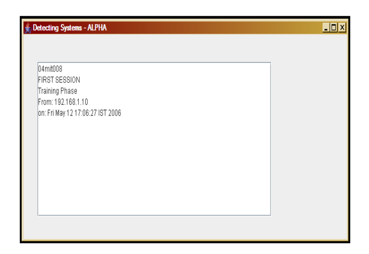
Figure 4.3: Alert message when a new user logged.

The figure 4.4 shows a window which displays each time when an existing user logged in through of the monitored hosts.