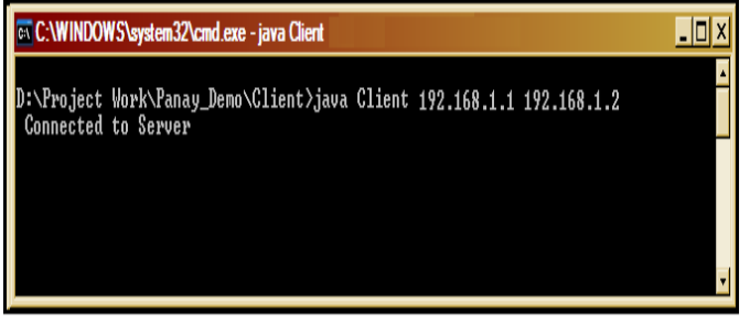
Figure 5.5: Host configuration window

The figure 5.5 shows the initial configuration of the local agent (192.168.1.10) with a list of IP addresses of two detecting servers ALPHA (192.168.1.2) and BETA (192.168.1.2). The local agent initially receives detecting services from ALPHA.