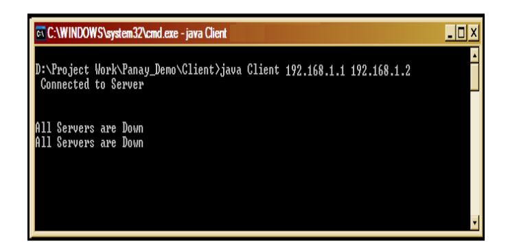
Figure 5.6: Servers failure message at Host

The figure 5.6 is message at the client when all the detecting servers become inactive.