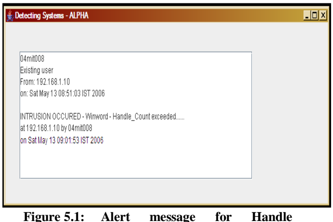
Figure 5.1: Alert message for Handle violation

The proposed system also supported fault – tolerant architecture, where hosts in one segment can receive detection services from other detecting servers in same or different segment. The Figures 5.1 and 5.2 were alert messages to administrator at the detecting system ALPHA during different sessions of the same user from different host. The Figure 5.1 notifies that the user '04mit008' attempted to use more number of MSWord applications than his usual behavior.