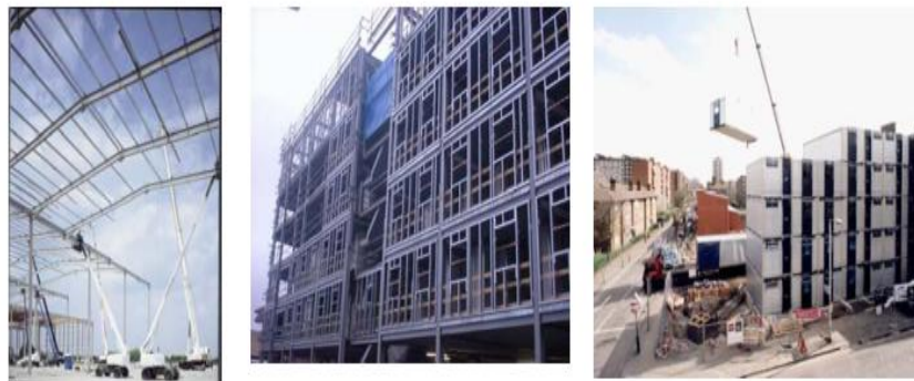
Figure 1: Prefabricated linear elements, infill panels and complete modules.

Home is one of the basic needs of human beings. In construction field steel has put positive impact on environment and also provides opportunity for profitable business resulting in steel construction. Healthy future is also obvious. During various stages how steel construction has delivered sustainability, is mentioned below[14]. The construction phase there are various aspects of sustainable development issues. One of the most important issues is impact on local human being and minimum waste. Off site fabrication has drastically reduced traffic congestion, noise and dust pollution. Moreover, maximum off site prefabrication has proved efficient, safe and fast construction. Minimum activities are carried out on site[14].