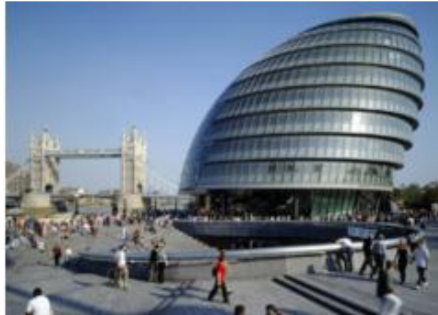
Fig: 2, City Hall London

Minimum waste is achieved by using less end of life building materials. Wet trade is minimized which helps dismantling and reuse of materials. Bolt connection and longer structural members provide opportunity for new design. In Sydney, Australia, Olympic aquatics stadium, Fig: 4, was dismantled and substantial parts were re-erected 100 km away for a football stadium with a grand capacity of 8500 spectators. Sustainable development advantages of recycling include minimum use of natural resources, less energy utilization and minimum waste. Keeping sustainability in mind, all new steel has recycled content[14].