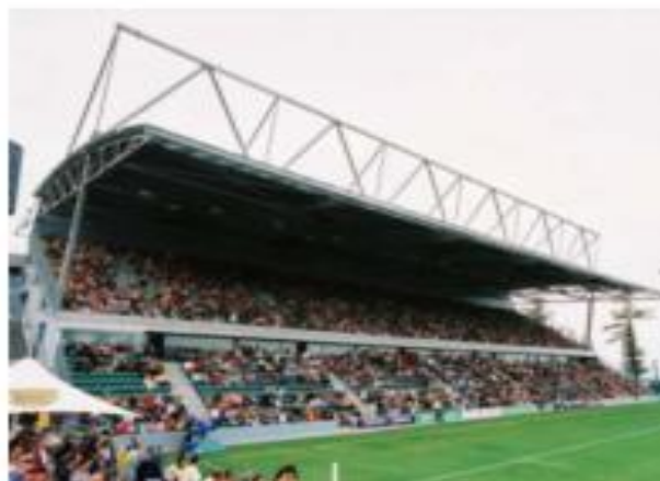
Fig: 4. Re-use of the Sydney Aquatics Stadium for football stadium