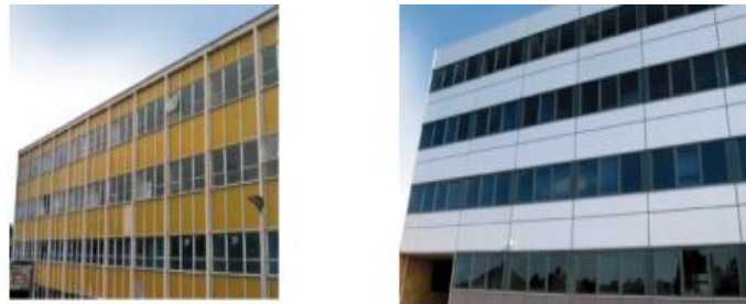
Fig: 3, before and after cladding