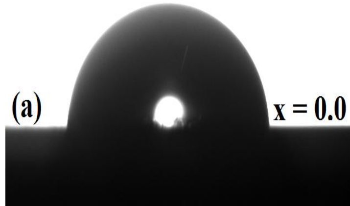
Fig. 2: Contact angle of \text{CoFe}_2\text{O}_4 thin film