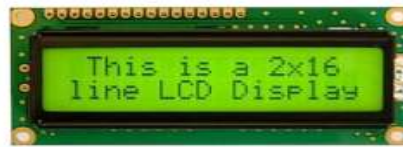
Figure 2: LCD Screen