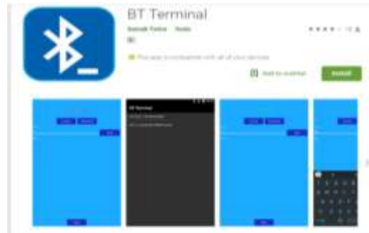
Figure 2: BT Terminal Android Application

The above figure is available on Google Play Store. Here in our project it used to give an input to our notice board from mobile phone.