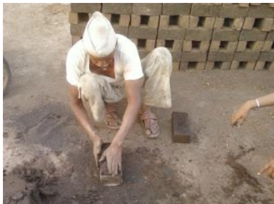
Fig. 1 Molding of Brick