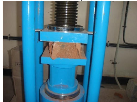
Fig.3 Compression Testing Machine

Burned bricks are used for the compression test only. The test result is shown in the following table.