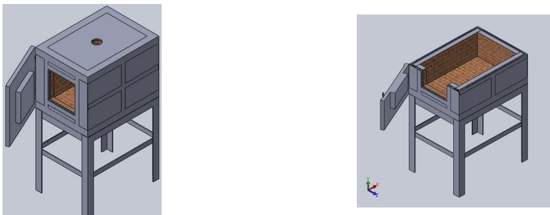
Figure 1. Furnace Schematic for Heat Treatments

After casting the roof, it was removed from the mold and glued with refractory mortar to the brick structure, finally a ceramic blanket was placed to cover the exterior brick walls of the kiln and separate them from the metal structure.