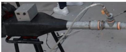
Figure 3. Torch connection via fan

Due to the high temperatures reached by the furnace, a torch connected by a fan was adapted to drive the gas and increase combustion