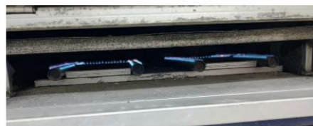
Figure 4. Burner