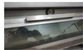
Figure 5. Pyrometer

It began by heating the furnace, considering the equilibrium diagram or phase diagram of the steel, which allows observing the phase changes that the aluminum is going to undergo in this process and identifying the critical points.